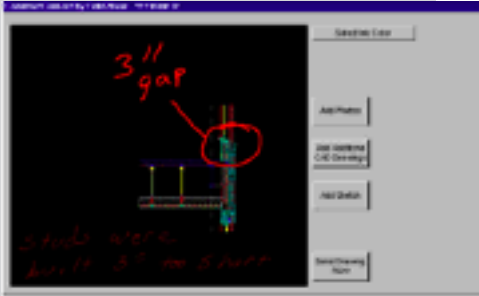
View, mark up, and share CAD files.