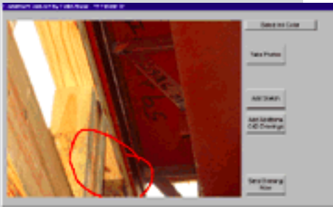
Take photos and make notes.